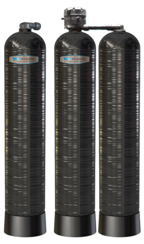
Kinetico CRS 1100 Chloramine Combination